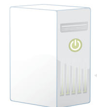
Client Production server

Real-time data replication ensures that, in the case of an unplanned outage, users are instantly redirected to a mirror version of their fileserver, which sits at a secure data center. Business continues as usual.