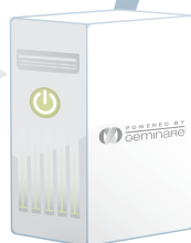
Replicated Server at Geminare